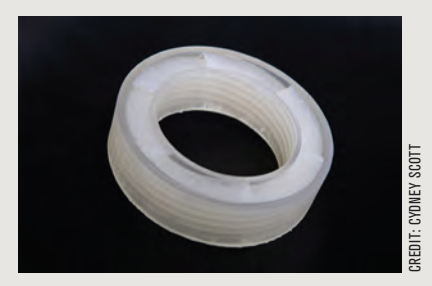
The mathematically designed, 3-D-printed acoustic metamaterial is shaped in such a way that it sends incoming sounds back to where they came from.

"Sound is made by very tiny disturbances in the air. So, our goal is to silence those tiny vibrations,"