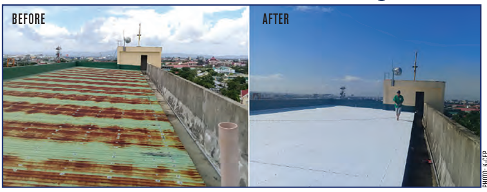
The roof at Naga College in the Philippines before (left) and after (right) becoming a cool roof, which reduces the absorption of external heat and the need for air conditioning in buildings.

The Challenge is a project of the Kigali Cooling Efficiency Program (K-CEP) in collaboration